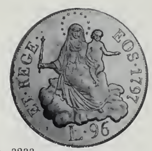
Lot No. 3233